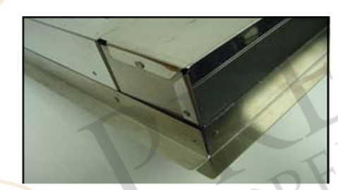
3/4" Flange for perfect fit.

SEVEN YEAR, IN HOME, LIMITED WARRANTY ON INSERT, THE BEST IN THE INDUSTRY! Please visit ImperialHoods.com to view the details on their warranty All dimensions on inserts are (+/-) 1/8" and are subject to change. Drawings are not to scale.