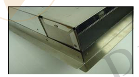
3/4" Flange for perfect fit.

SEVEN YEAR, IN HOME, LIMITED WARRANTY ON INSERT, THE BEST IN THE INDUSTRY! Please visit ImperialHoods.com to view the details on their warranty.